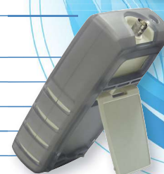
Protective rubber armor with benchtop stand