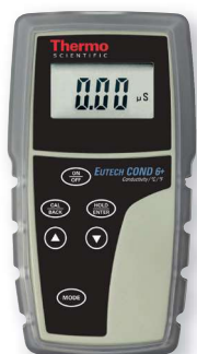
COND 6+ handheld conductivity meter