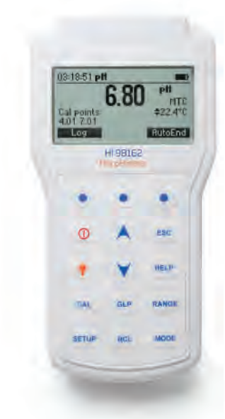
HI98162 pH Meter for Milk includes: