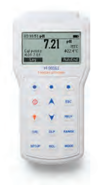
HI98161 pH Meter for Food includes: