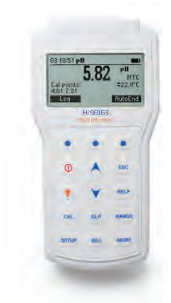
HI98163 pH Meter for Meat includes: