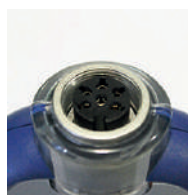
Secure Lumberg Connector

Rugged Waterproof Polycarbonate Case with BioCote® Antimicrobial Protection