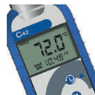
Max/Min feature recalls highest and lowest reading