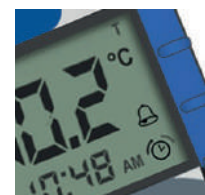
Count-down timer and alarms