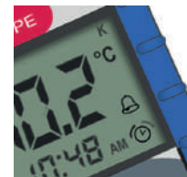
Count-down timer and alarms