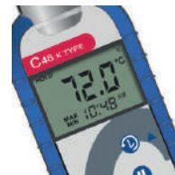
Max/Min feature recalls highest and lowest reading