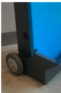
CAP3500 Wheel base