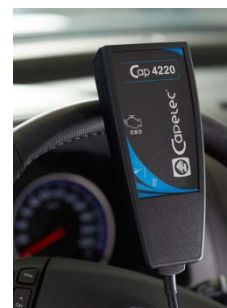
CAP4250 EOBD scantool